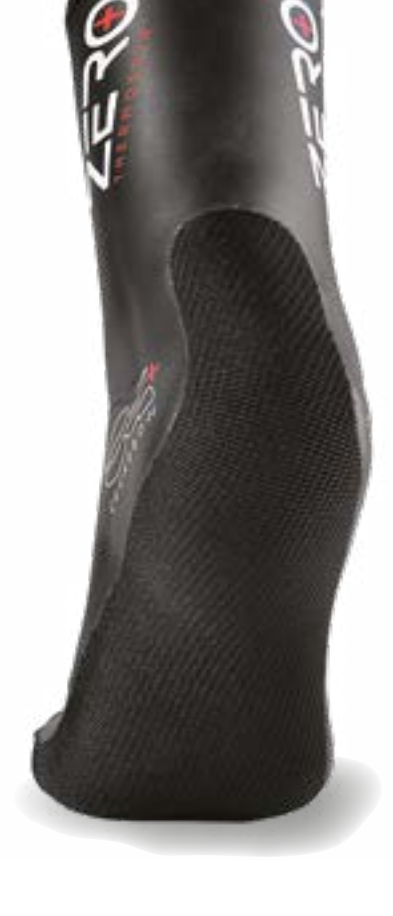
POWER-GRIP ON THE HEEL WITH NO SEWING