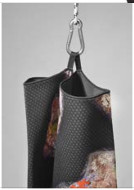
HOOK TO HANG THE PANTS