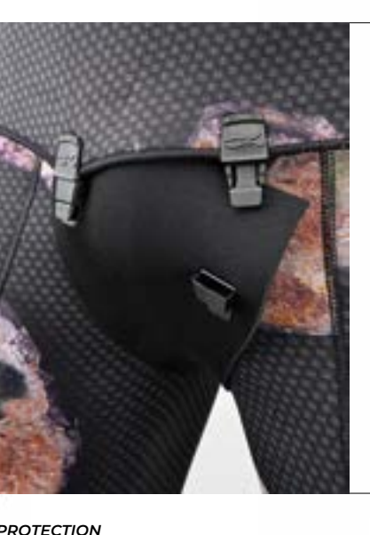
PROTECTION ON THE KNEES